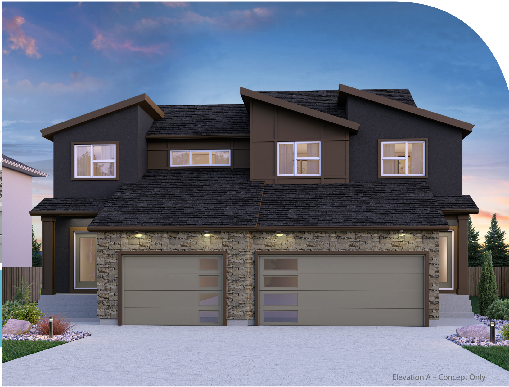
Elevation A – Concept Only

Photos shown are of various models with upgraded features.